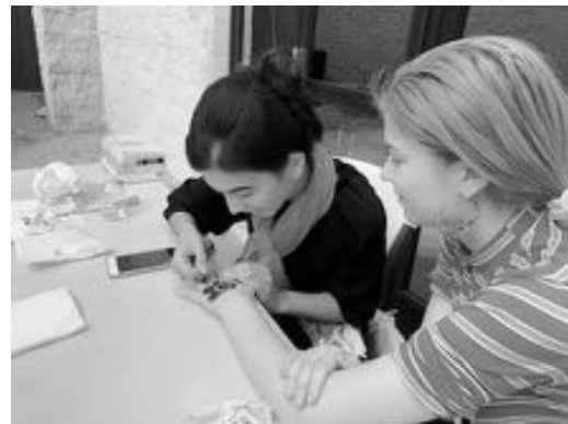
Henna Hand Painting