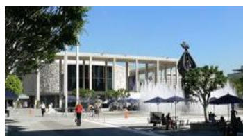
Mark Taper Forum