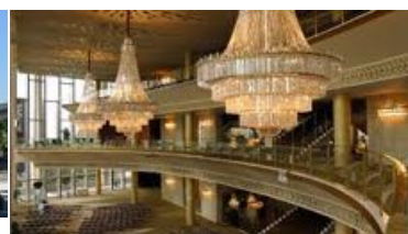
Dorothy Chandler Pavilion