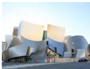
Walt Disney Concert Hall

See Adult Jewish Learning Schedule, page , for more details.