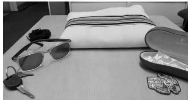
Items in the Lost and Found in the TBI Office.