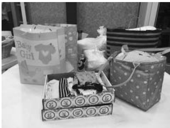
Baby Shower gifts from TBI members