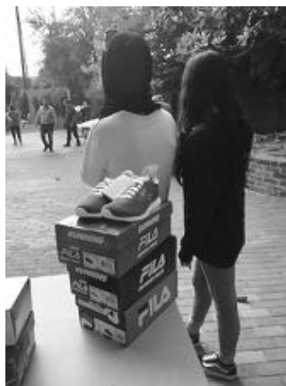
Shoes That Fit