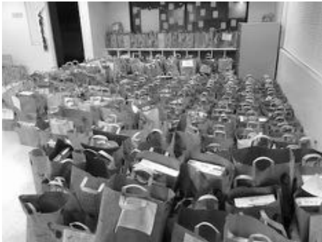
Room 12 filled with grocery bags