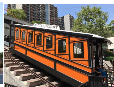
Angels Flight Railway