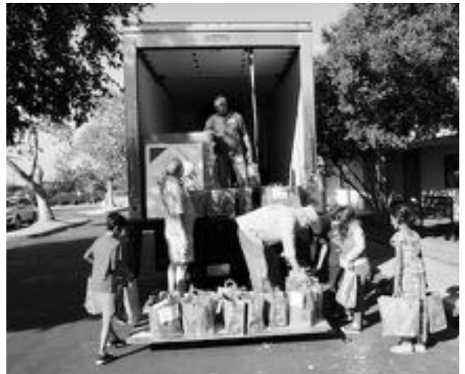
Beit Sefer students bring bags to IVHP truck.